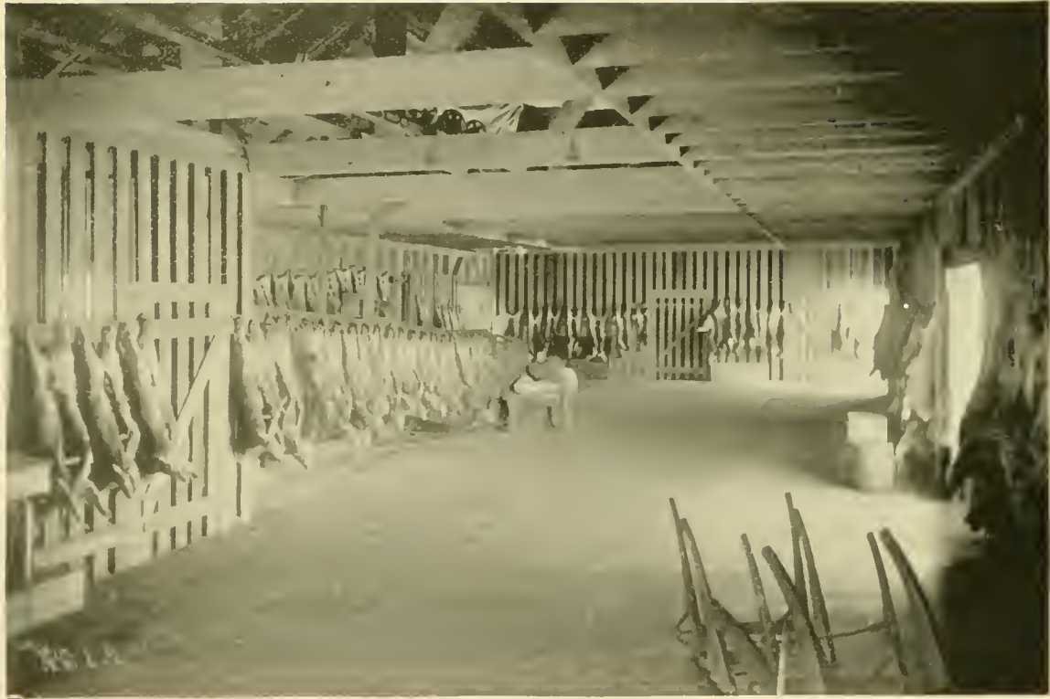
One hundred and eighty-seven Deer in Warehouse.